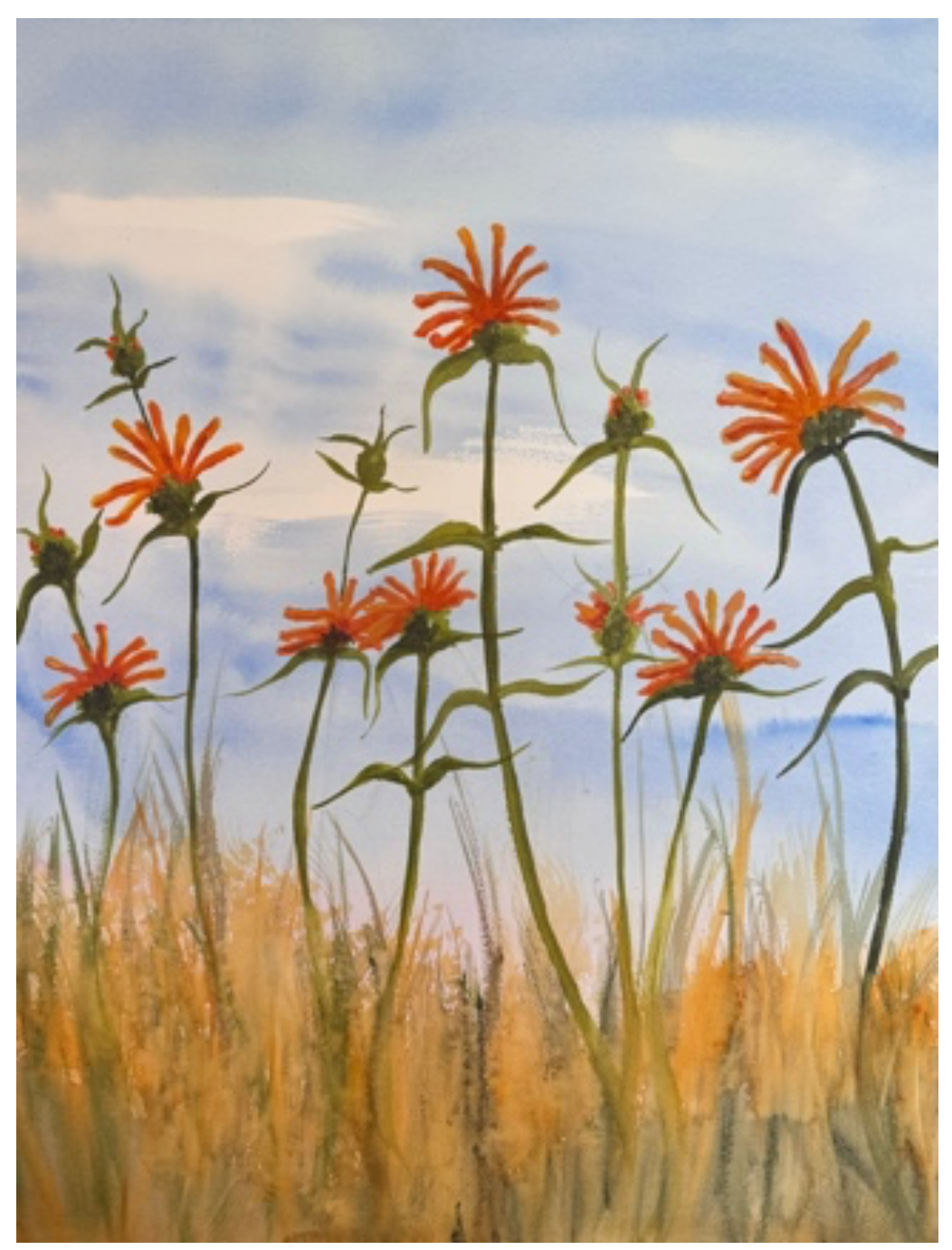
Lion's Paw #3 Watercolor on Paper 24" x 18"

I get "crushes" on plants and will spend a great deal of time observing them, photographing them, drawing, and painting them. Unraveling the secrets of their beauty and taking healing from their presence.