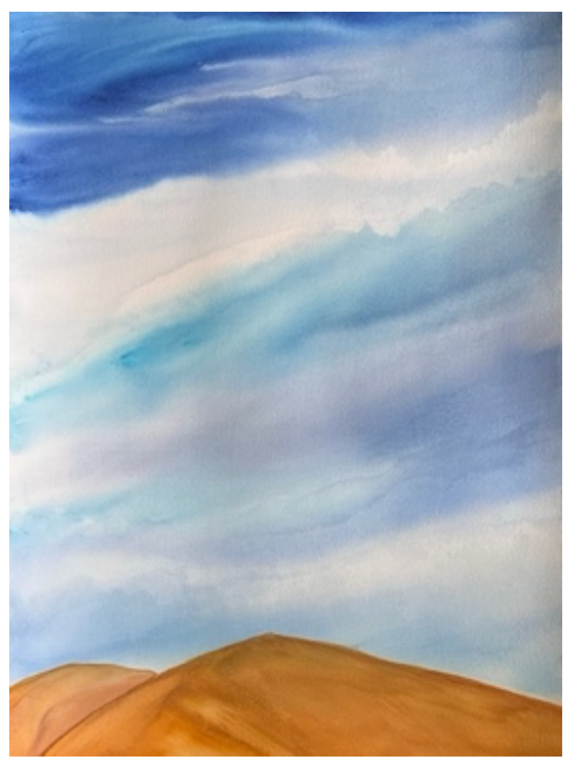
Highway 58 Watercolor on Paper 30" x 23"