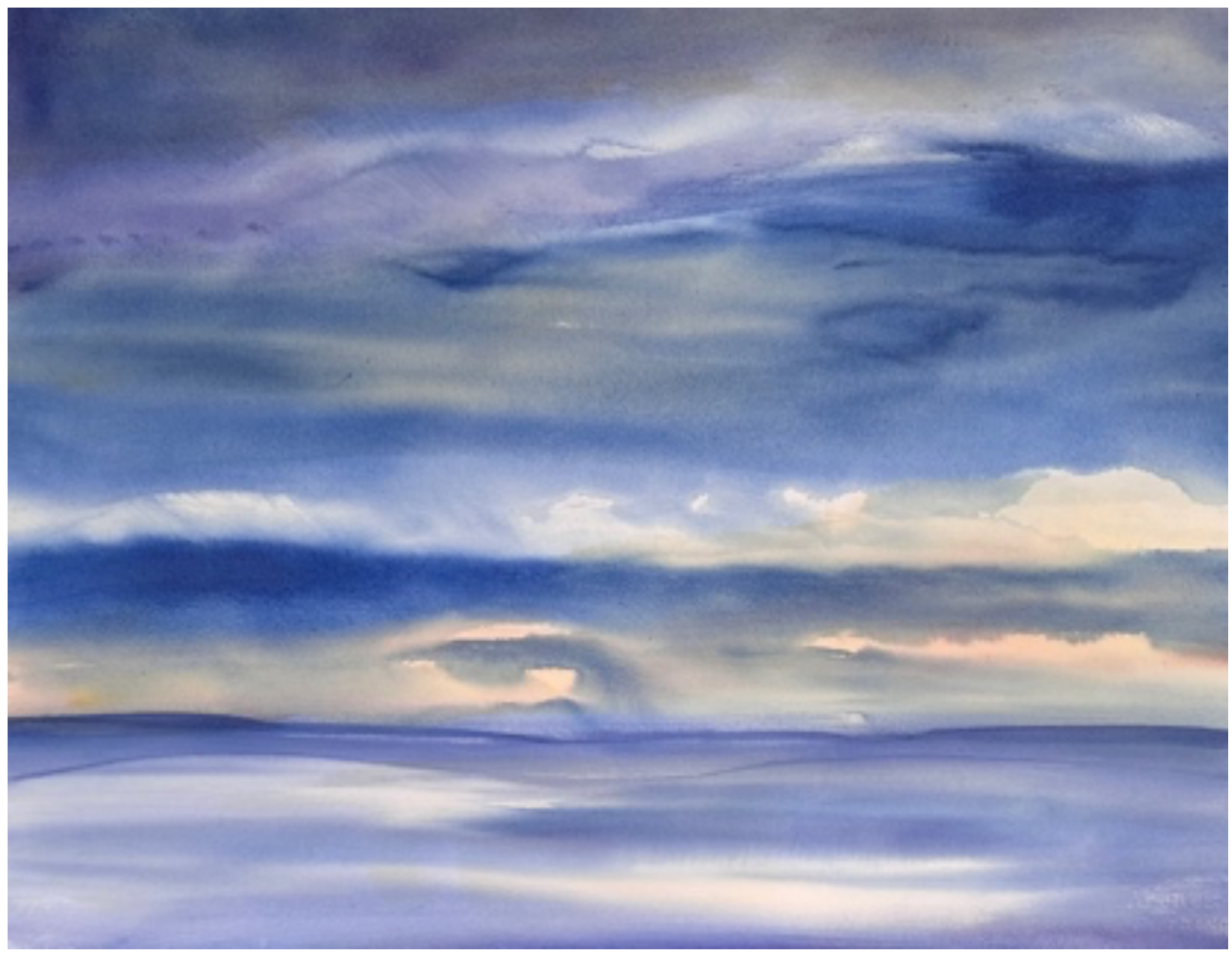
The Port of Baton Rouge Watercolor on Paper 23" x 30"