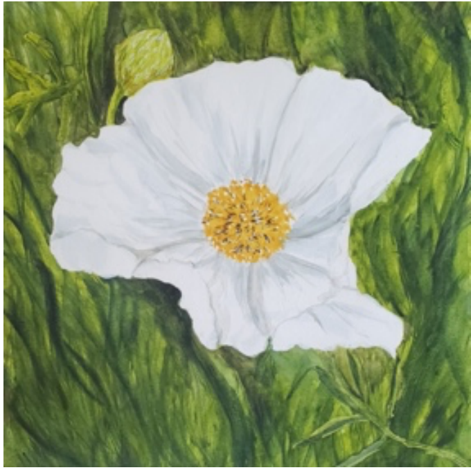
Mantijilia Poppy Series #2 Watercolor on Paper 12"x 12" $150